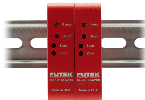
Figure 1: Amplifiers provide a clean, precision analog signal for your PLC

Next you will need to understand the importance of signal conditioning. Signal conditioning is the process where an incoming signal is modified so it is more suitable for capture by a PLC or DAQ. Analog sensor signals are susceptible to electrical noise, which can distort or skew